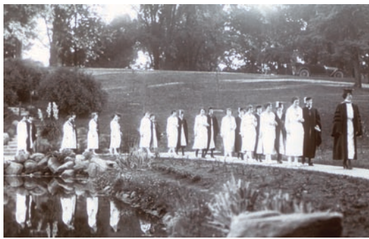
Mortar Board was founded in 1918 as the nation's first college senior honor society for women. In 1975, the honor society was opened up to men. Today, nearly a quarter of a million members are a part of the tradition. Pictured here are Mortar Board women on the campus of The Ohio State University early in the organization's existence.

As the world was starting to think outside of the box in the way of traditional women's roles (cooking, cleaning, child-rearing) in the early 20<sup>th</sup> century, so was