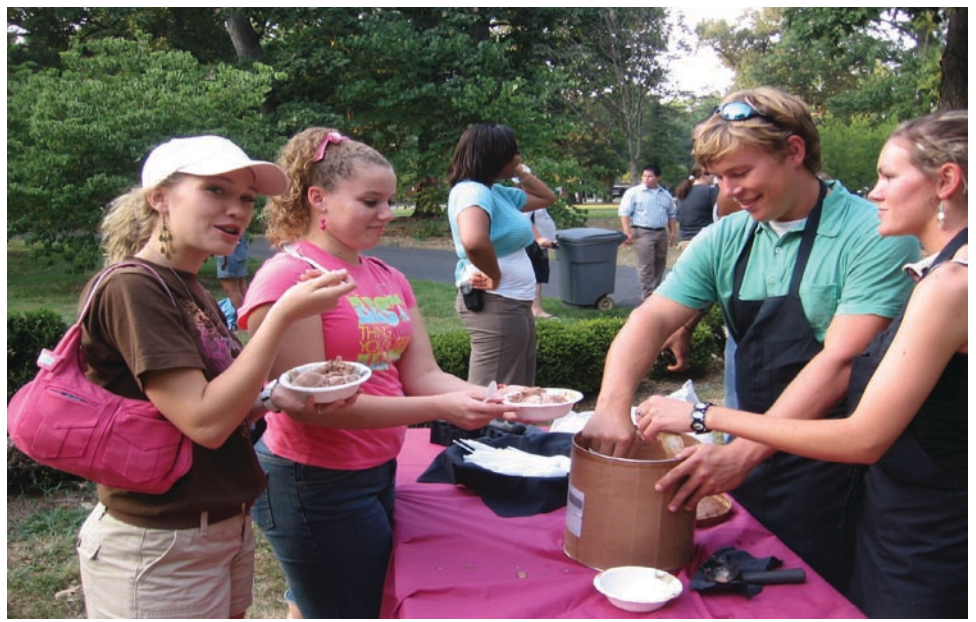
The Alpha Sigma Chi chapter at Berea College held an ice cream social this fall.

To learn more about Banned Books Week visit, www.ala.org/ala/oif/bannedbooksweek/bannedbooksweek.htm