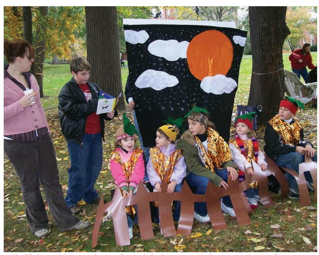
This fall, the Laurel chapter at Lake Erie College worked with Tomorrow's Teachers to put on the Storytelling Harvest.

The Laurel chapter at Lake Erie College recently worked in cooperation with Tomorrow's Teachers to hold the fall