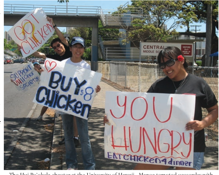
The Hui Po'okela chapter at the University of Hawaii - Manoa tempted passersby with signs promoting their Huli Huli chicken sale.

The Phi Delta Psi chapter of Mortar Board has been gearing up for weeks in anticipation of the plethora of planned events. Recently, a number of members participated in the University of Illinois' program entitled "I-Help," a university-sanctioned event that allows students from more than 40 different student organizations to come together to help out the community. Participation in this event not only promoted Mortar Board around campus, but allowed members to bond with one another. After this very successful first event, the chapter