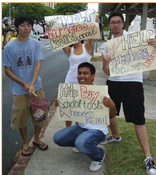
University of Hawaii at Manoa chapter members raised money to help provide school supplies to children in need with Helping Hands of Hawaii.

The Hui Po'okela chapter strives to uphold the ideals of scholarship, leadership and service with various activities. One of the community service projects the chapter has implemented is a graffiti paint-out in the surrounding neighborhoods and schools, where members picked up garbage and removed stickers from walls and underpasses. Members also volunteered at Rediscover Makiki: Sunset on the Park, a two-day festival held in July that gave Manoa's Mortar Board members a chance to interact with children while celebrating the revitalization of Makiki District Park. The chapter has also raised money and gathered school supplies for children in need with Helping Hands of Hawaii, an organization that gives underprivileged children a chance to