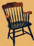
Captain's Chair $340