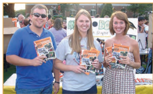
Members of the chapter at Oklahoma State University promoted Mortar Board by sharing information at a campuswide event, Light on Stillwater.

The Achafoa chapter recently took part in Light on Stillwater, a campuswide event held to publicize college and community organizations that current students can join. Mortar Board was present with a "bang," as chapter representatives enthusiastically promoted the Society. The event was a success as the students were excited about Mortar Board. Additionally, many underclassmen learned about and then applied for the Top 10 Freshmen Award, a