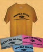
Color Block Letter Tee $10