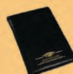
Junior Deluxe Padfolio $12