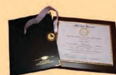
Medallion Graduation Set $50

Order online - www.mortarboard.org/merch