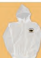
Hooded Sweatshirt $25