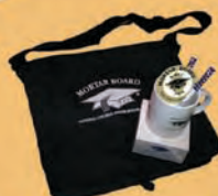
Collegiate Messenger Set $20