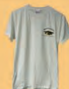
White Screened Tee $8