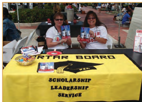
San Diego State University members raise money by selling a Mortar Board planner on campus and in bookstores.