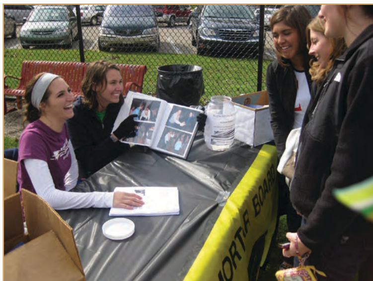
Current members and alumni from the Hope College Alcor chapter support literacy by participating in the Alumni Book Drive held during the homecoming football game.

tutoring program for at-risk elementary students. Chapter members are grateful for the continued support of Hope students, faculty, staff and alumni in their contributions to this project.