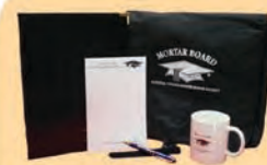
Executive Messenger Set $45