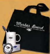
Collegiate Tote Set $15