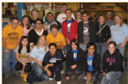
Members from five chapters in Section 17 gathered for a section project in Kansas City, Missouri, at Harvesters Community Food Network.