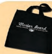
Tote Bag $6