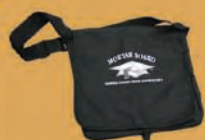
Messenger Bag $17