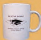
Black & White Mug $5