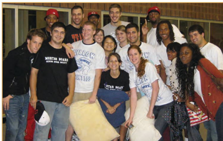
The Mabel G. Freeman chapter held its Sixth Annual World’s Largest Pillow Fight attempt this fall. Pictured above are chapter members as well as members of The Ohio State University basketball team.

For the month of October, the chapter pursued the national philanthropy of “Reading Is Leading” by reading to school children at