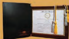
Cord Graduation Set $50