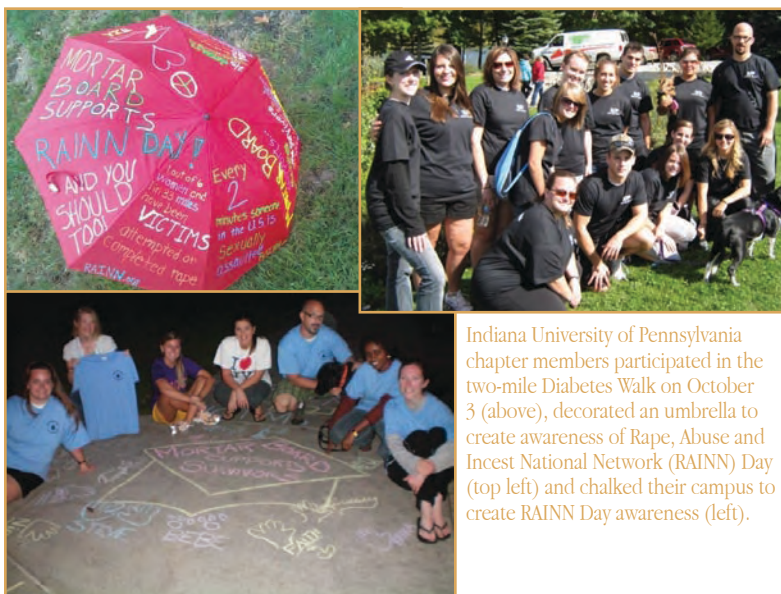
Indiana University of Pennsylvania chapter members participated in the two-mile Diabetes Walk on October 3 (above), decorated an umbrella to create awareness of Rape, Abuse and Incest National Network (RAINN) Day (top left) and chalked their campus to create RAINN Day awareness (left).