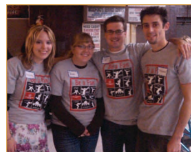
University of Wisconsin - Eau Claire chapter members volunteered at a Special Olympics bowling tournament held in their community.

Five members of the Gold Caps chapter devoted 28 hours of service by building friendships at Special Olympics Indianhead's Southern Bowling Tournament, where more than 400 athletes competed at three bowling alleys in Eau Claire. Mortar Board members volunteered as lane assistants, helping the athletes to focus and have a good time.