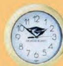
Quartz Clock $20