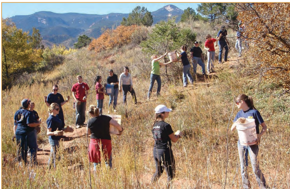
Representatives from six chapters in Section 22 moved 3,500 pounds of dirt up a hill to repair an erosion gully in the Garden of the Gods Park.