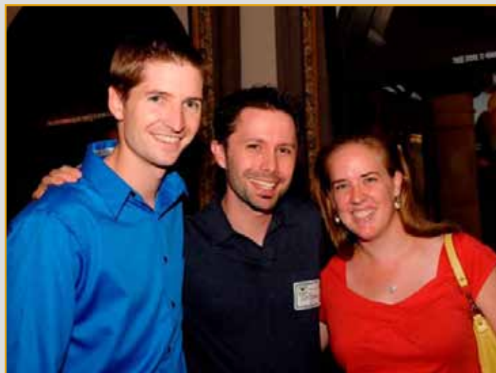
Alumni of the Alcalá Senior Honor chapter at the University of San Diego gathered for a reunion in 2010.

Certification for advisors. Also at the 2010 National Conference, Mortar Board introduced Leadership Excellence and Advisor Development (LEAD), a certification program for advisors. A recent study conducted