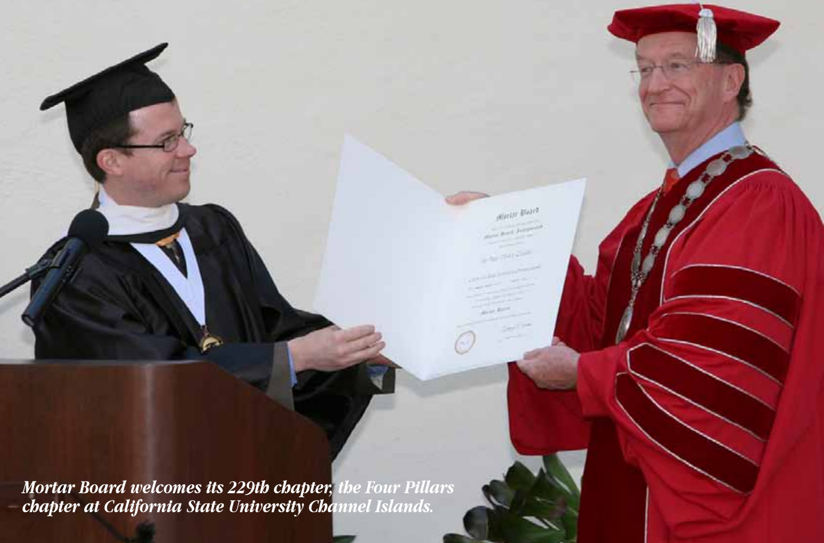
Mortar Board welcomes its 229th chapter, the Four Pillars chapter at California State University Channel Islands.