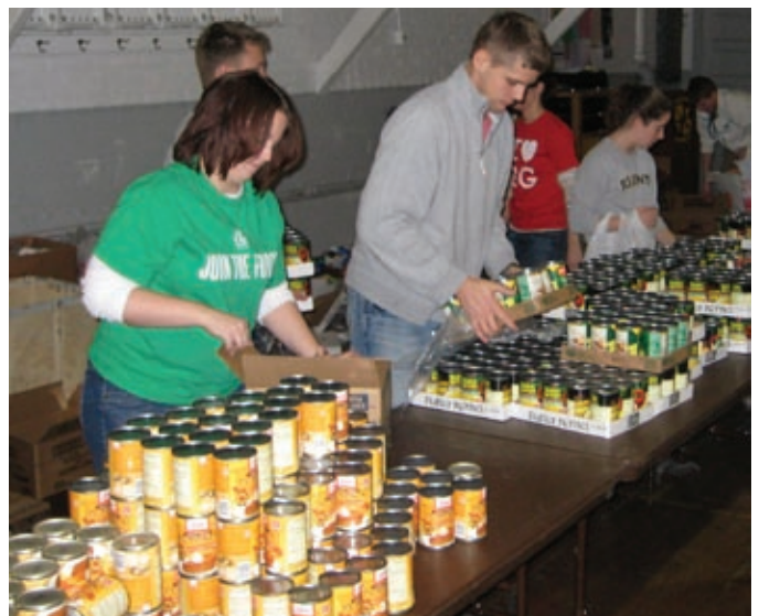
University of North Dakota chapter members sort canned goods to package as a part of their charitable turkey basket program, which fed more than 800 families on Thanksgiving in 2007.

The weekend before Thanksgiving, the chapter assembled their turkey baskets, which consisted of potatoes, pie crust, pie filling,