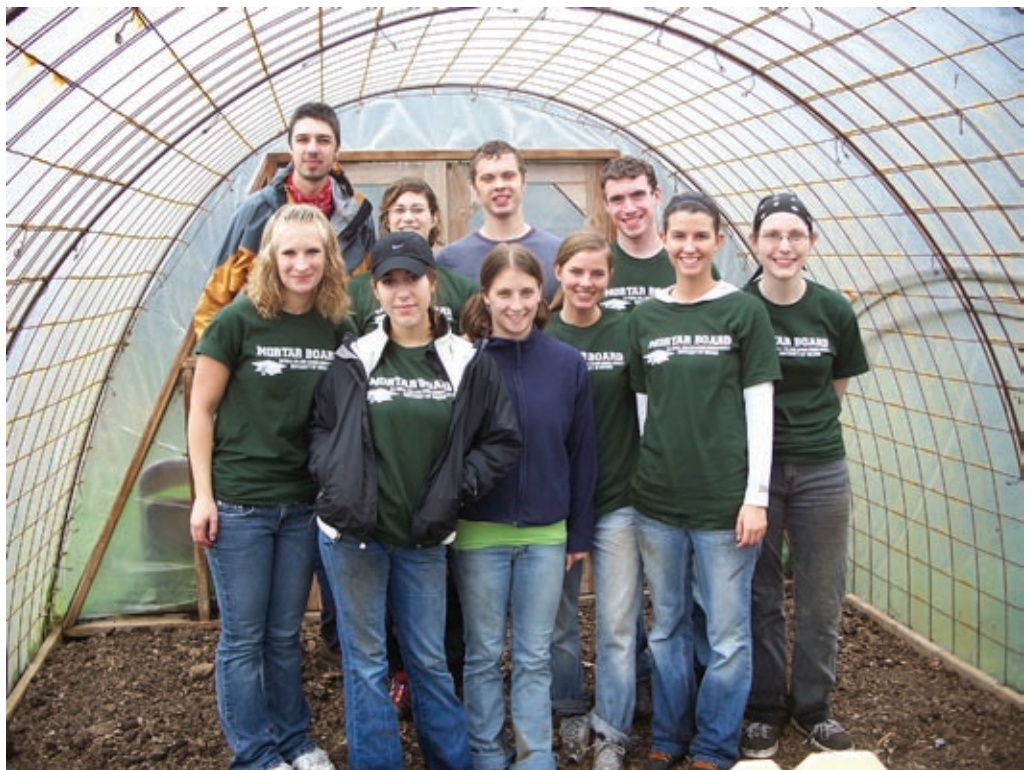
University of Oregon chapter members volunteered at Food for Lane County's community garden to help feed those in need.

The chapter maintains strong involvement