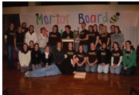
The Drury University chapter hosted a Mortar Board spelling bee, complete with a host dressed as a bumblebee.