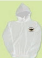
Hooded Sweatshirt $25