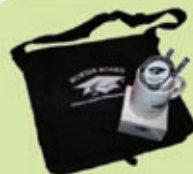
Collegiate Messenger Set $20