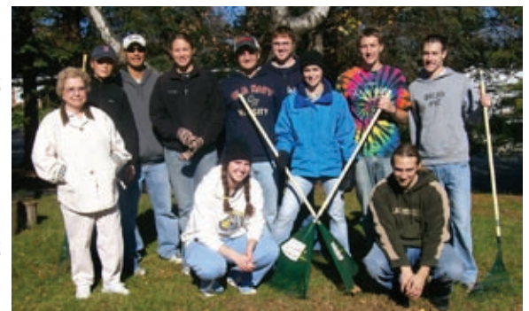
University of Wisconsin - Eau Claire Mortar Board members cleaned up the community as a part of the "Tidy up the Town" project.

Members came together with other students and faculty leaders to discuss campus-wide issues and helped represent the student body. The chapter aided in the decision making process on budgeting issues, new admission requirements, study abroad programs and the majors offered at Eau Claire. Members also sell roses at each graduation ceremony to help fund