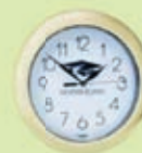
Quartz Clock $20