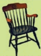
Captain's Chair $325