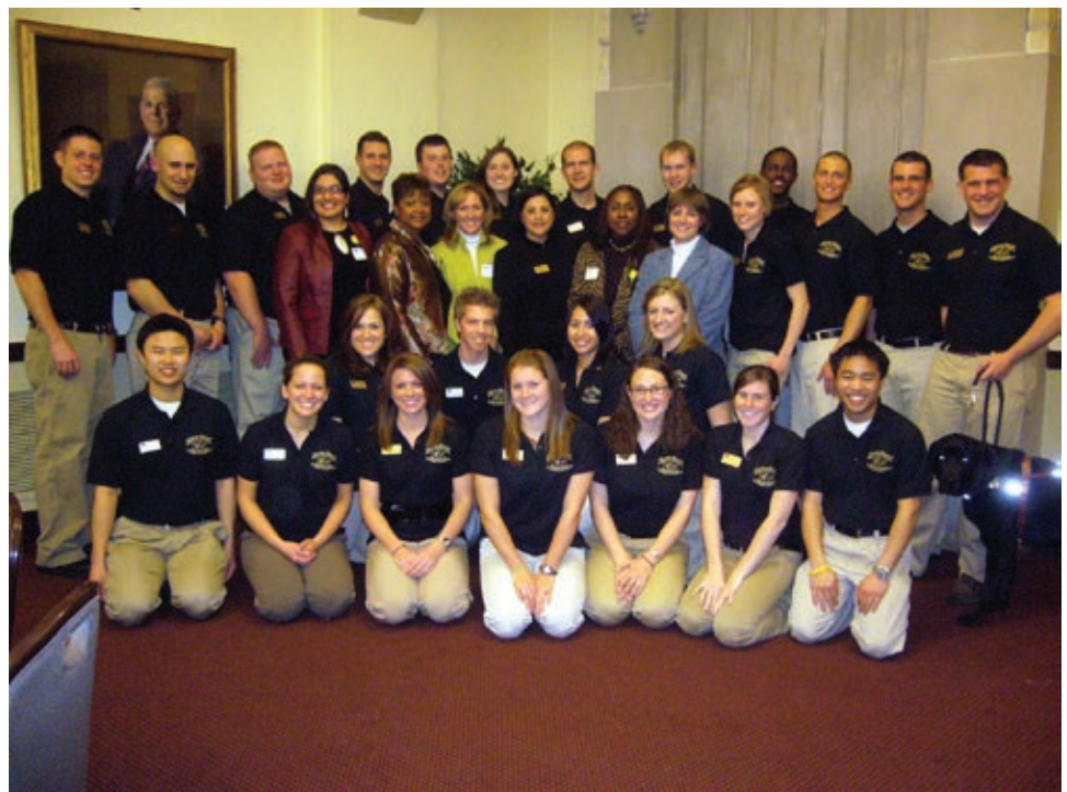
The Women of Purdue honorees with the Purdue Mortar Board class of 2007-2008

The Reading Extravaganza was another successful event and the children had a lot of fun listening to the event's celebrity readers. Purdue administration, faculty, staff, athletes and other local and state celebrities hosted reading sessions throughout the day for more than 350 students. The students also enjoyed several activity sessions with Alpha Psi Omega National Theatre Honor Fraternity.