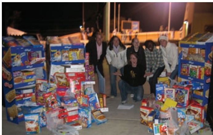
Carson-Newman College chapter members collected cereal as a part of their 2nd annual Cereal Bowl flag football tournament.

The Xavier University and University of Cincinnati Mortar Board chapters collaborated