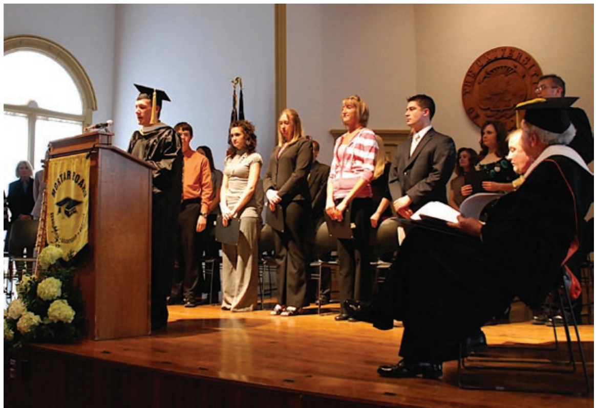
Initiates and supporters are a part of The University of Findlay installation ceremony held March 25, 2008.