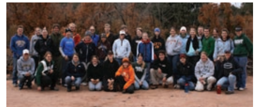
Section 22 annually volunteers their time at the Garden of the Gods park in Colorado Springs. In 2007, nearly 40 members from six chapters worked together to beautify the park.