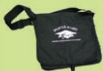
Messenger Bag $17