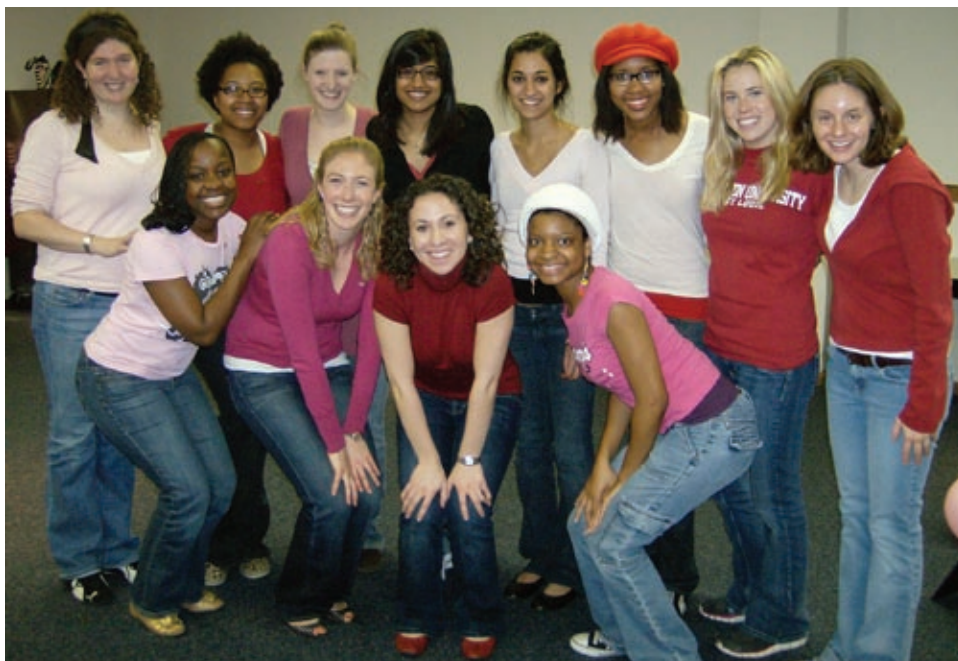
Members of the Washington University - St. Louis chapter celebrate Reading is Leading by volunteering their valuable time at University City Library.

The South Dakota State University Sigma Lambda Sigma chapter of Mortar Board had a primary goal during the 2007-2008 academic year: to increase visibility of their Mortar Board chapter. To accomplish their goal, the chapter participated in a variety of university-recognized and community activities. Mortar Board members participated as a team in the SDSU Hobo Day (homecoming) Bum Olympics. Volunteers also helped with the Hobo Day parade. To celebrate Halloween, members hit the streets by trick-or-treating for books and cans to donate to the local food pantry. They received a trunk full of donations. The group also went to Brookview Manor, a local nursing home, and played games with the residents for a few hours. The residents were thrilled to have Mortar Board members there, and