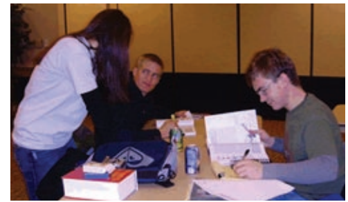
A University of Wyoming Mortar Board member helps students with their homework at their tutoring and game night held during Mortar Board Week.

Thursday afternoon, Mortar Board held its first Knowledge Quest. The chapter hopes that this will become a tradition on the University of Wyoming campus. Twenty-five questions concerning the University of Wyoming and its history were prepared for the event, and students were given the opportunity to answer as many of the questions as possible, either in pairs or as individuals. Teams and individuals were scored on the number of questions answered correctly. The first and second place finishers received $50 and $30 gift certificates, respectively, to Altitude Chophouse and Brewery in Laramie, Wyo. The third place finisher received a Giant Sub from Subway. All