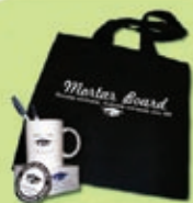
Collegiate Tote Set $15