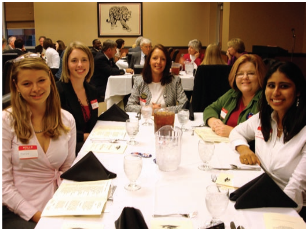
University of South Alabama chapter members and honorees mingle at the group's annual "Top Prof" Banquet.

Faculty appreciation events were also a major focus of the Azalea chapter's Mortar Board Week events. In order to show their appreciation, chapter members delivered Krispy Kreme