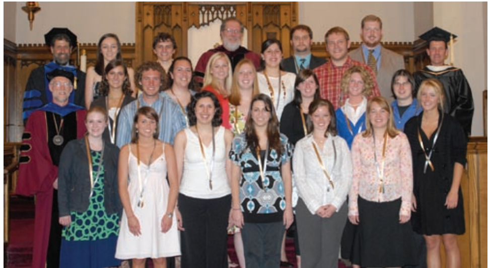
Lenoir-Rhyne College initiates and advisors pose after the installation and initiation ceremony held April 27, 2008.