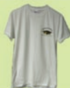
White Screened Tee $8