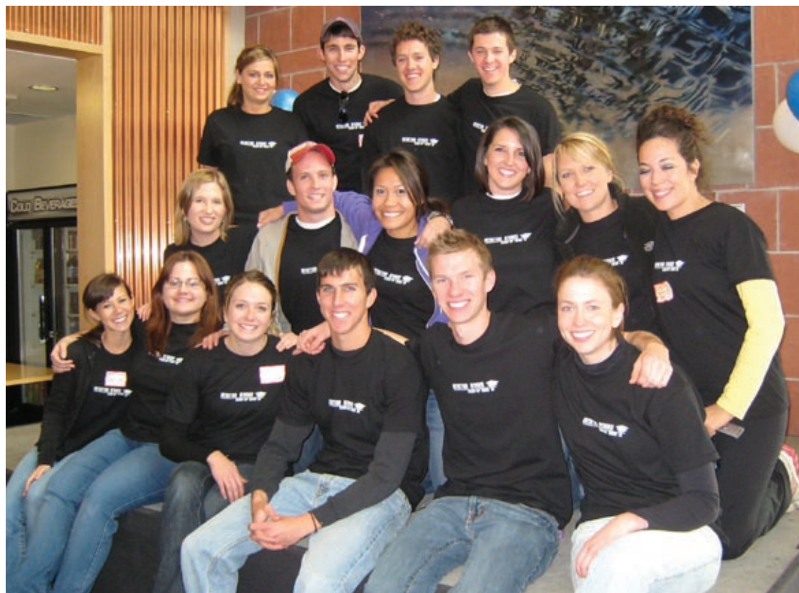
University of Arizona chapter members take a quick break from their largest-ever student-led neighborhood clean-up project, “The Crew.”

The group began the year by hosting the 2nd annual Cereal Bowl, during which a team of faculty and staff took on the Carson-Newman redshirt team in a game of flag football. Boxes of cereal were collected as admission to benefit the Appalachian Outreach