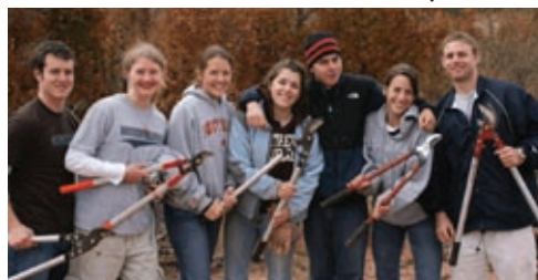
Members of the University of Northern Colorado chapter pose with their tools at the Garden of the Gods section project.

One cold and snowy Colorado morning, the Mortar Board members of the Gold Key chapter at the University of Northern Colorado awoke. They were about to embark on their regional service project, the Garden of the Gods. With steady winds from the north to help lead them south, from Fort Collins to Colorado Springs, the Mortar Board members were determined to arrive. After the two and a half hour drive, they arrived to the smiling faces of two park rangers and other Mortar Board groups from across the state. Past Mortar Board teams have reconstructed worn paths and other vital park renovations. Today's briefing informed the groups that overgrown shrubs were starting to create hazardous fire conditions around the park. Their job as volunteers was to utilize a variety of saws, trimmers, tarps, rope and manpower to remove as many dead plants as they could in a designated area. This area would then serve as a natural fire block in the event of a fire. The teams began to tug, pull and push their way through the dense shrubs in order to locate and determine which area to overhaul. The hard manual labor seemed to be in the forefront of their minds as the scenery of the Garden of the Gods overwhelmed the teams. This 480-acre public park is home to breathtaking towers of natural sandstone formations, hiking paths and wonderful views of Pikes Peak. After a half day of work