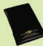
Junior Deluxe Padfolio $12