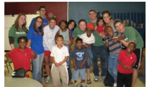
Texas Tech University chapter members get to know children who attended the Dr. Seuss-themed literacy event at the Parkway Center.