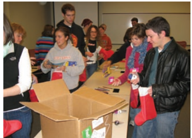
Hope College chapter members stuff stockings for local children associated with the Court-Appointed Special Advocates (CASA) program.

Hope students also helped to make the holiday season special for local children in the