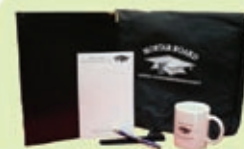
Executive Messenger Set $45