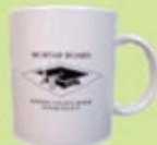
Black & White Mug $5